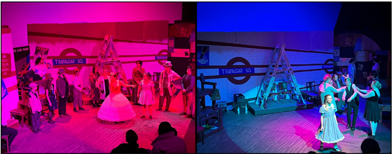
"Alice by Heart" at Kalamalka Secondary's Apple Box Theatre in Coldstream.