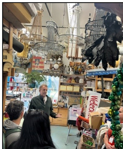
Touring the Art's Club prop shop