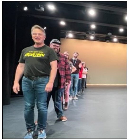
ABCDE members learn some Choreography