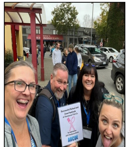
Lunch group discussions