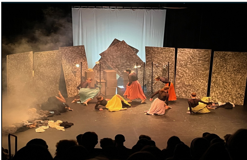
90 Seconds by NDSS in Nanaimo