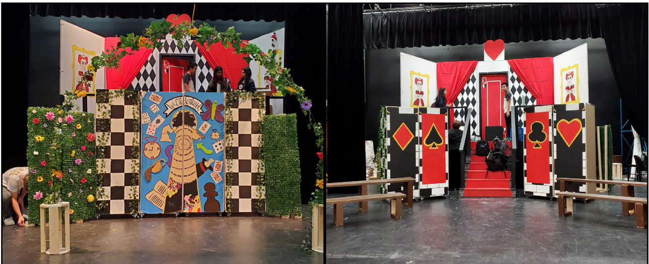
"Alice In Wonderland" at Fleetwood Park Secondary School.