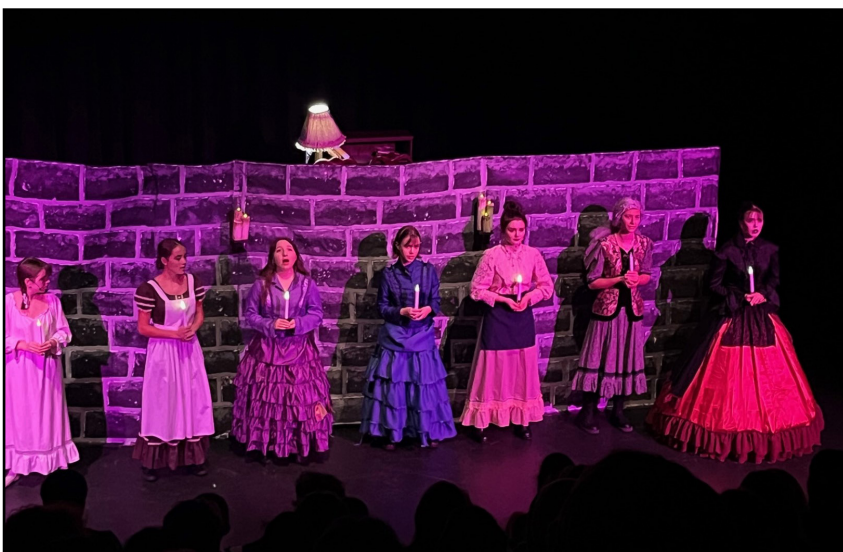
Seven Brides for Dracula by Wellington Secondary in Nanaimo