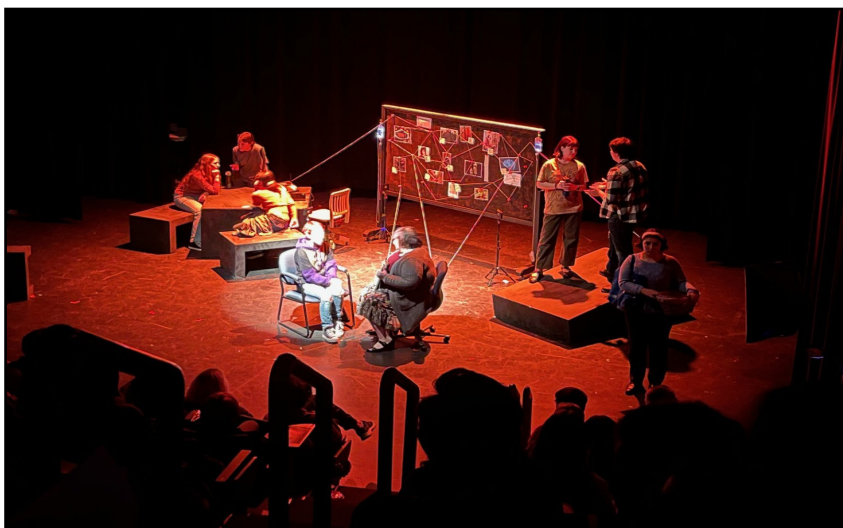
TRAP by GP Vanier in Courtenay