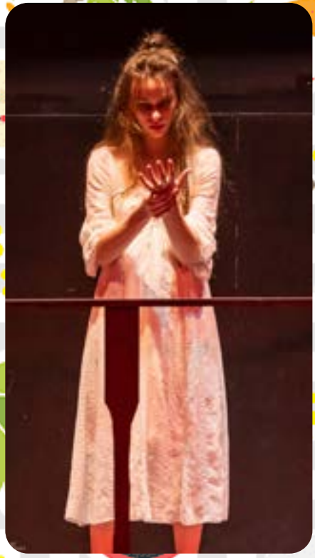
Highlights from Macbeth Moscrop Secondary Burnaby