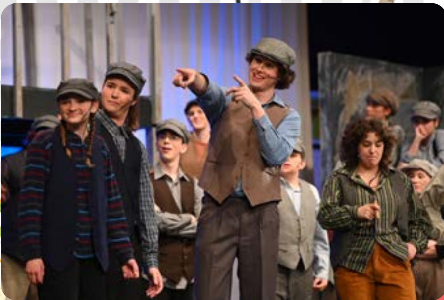
NEWSIES Carihi Secondary, Campbell River Carihi lost this show in 2020 when Covid hit, but brought it back this year. The Grade 12s got closure on a show they were part of in 2020 and the rest of the cast got to see what all the fuss was about!