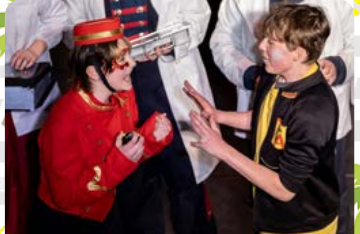
Highlights from All the Time in the World and Xanadu by Colquitz Middle School, Victoria