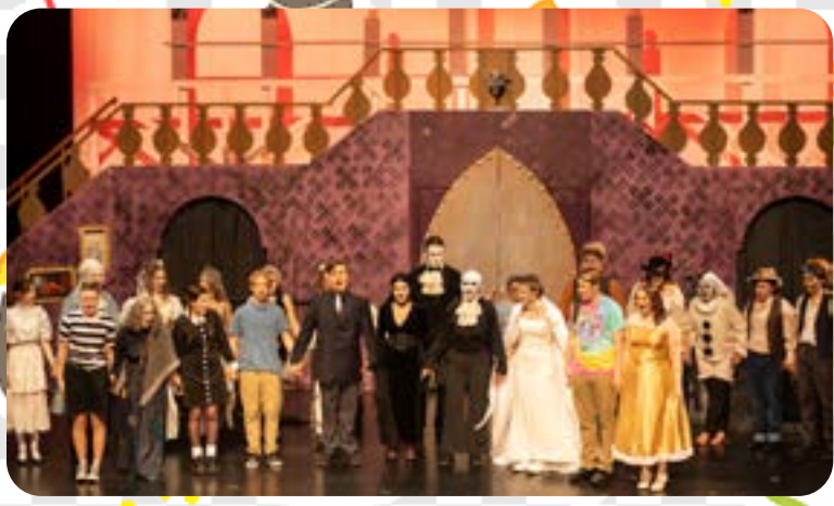
Highlights from The Addams Family Brooks Secondary, Powell River