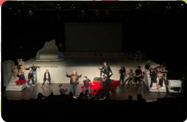
Highlights from GREASE Garibaldi Secondary Maple Ridge