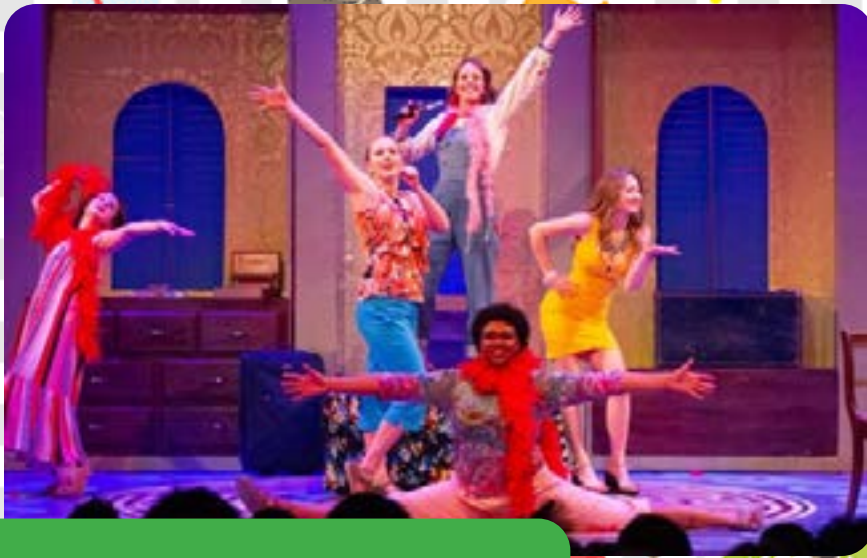
Highlights from Mamma Mia Smithers Secondary, Smithers