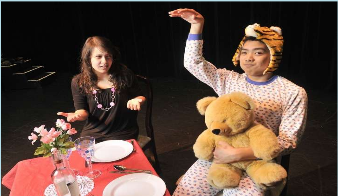
North Surrey Secondary in dress rehearsal with their 2011 Provincial festival production of: Check Please

All students attending the Provincial Drama Festival must be supervised/chaperoned by an ABCDE Drama Teacher/Member.