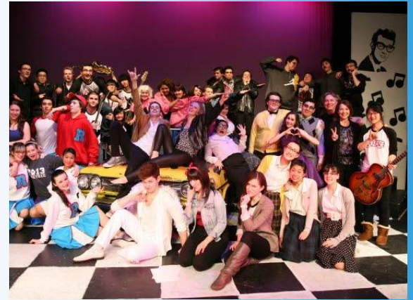
Pinetree's Production of GREASE, 2013