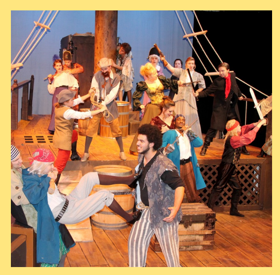
Treasure Island—December 2012

Current Production: Joseph and The Amazing Technicolor Dreamcoat - May 22-June 1,2013