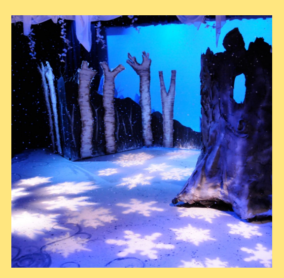
The Lion, The Witch and The Wardrobe