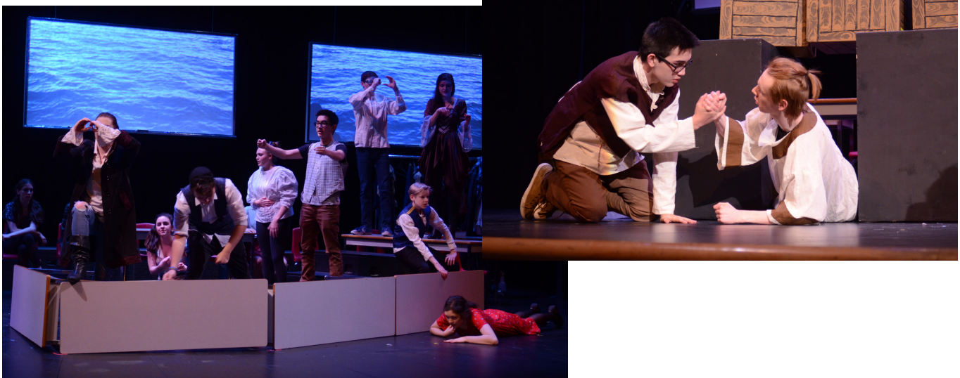
Scenes from MONTE CRISTO, performed by students from Rockridge Secondary, West Vancouver, BC