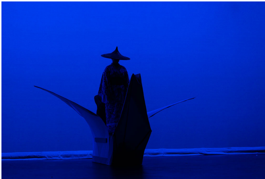
Correliou Secondary, Quesnel - "A Thousand Cranes" - at the NTS Provincial Drama festival