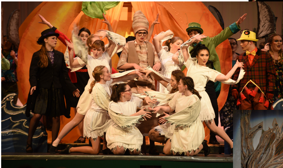
Carihi Secondary, Campbell River - James and the Giant Peach