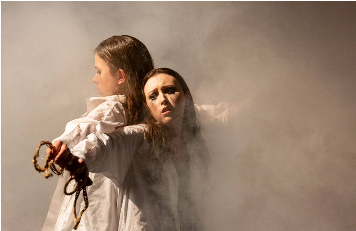
Highland Secondary, Comox - "epistolary" - at the NTS Provincial Drama festival