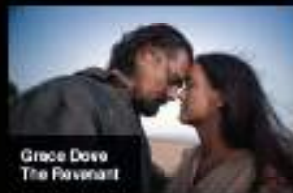
Grace Dove The Revenant