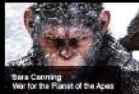
Sara Canning War for the Planet of the Apes

Tell your students about VFS: For more info / speak to an Advisor, Call 1.604.695.5808 or visit vfs.edu/contact