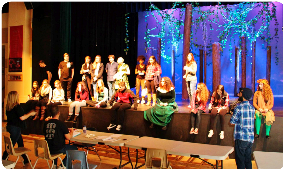
Pictures from some of Dover Bay's past productions: The Crucible , West Side Story , and Into the Woods .