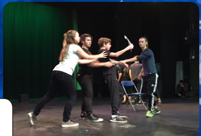
Students from North Vancouver Island got to experience a once in a lifetime workshop with Frantic Assembly.